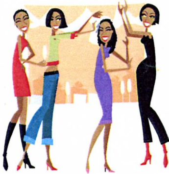
DARLING FOREVER, FOREVER, YOU CAN BREAK MY HEART