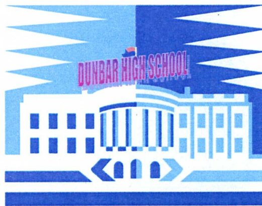
WE LOVE OLD DUNBAR BEST OF ALL!

We love old Dunbar best of all the Ideals for which She stands...Who we are today we owe to our Dunbar Family. We should stand very tall and be proud to have been in the great legacy of graduates from this mighty institution. The Class of 1965 , 147 strong, has left a lasting impression for all to remember !